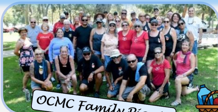
OCMC Family Picnic