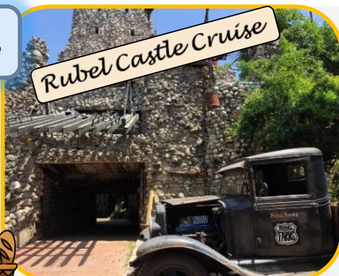
Rubel Castle Cruise