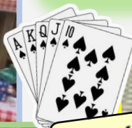
North Meets South Poker Run